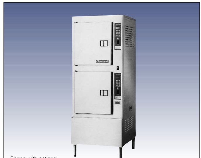
Shown with optional Electronic Timer